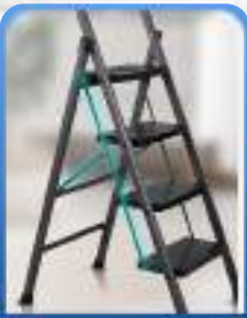
Strong Panel Support