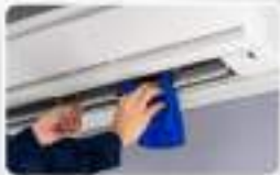
Clean Air Conditioner