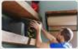
Reach High Shelves