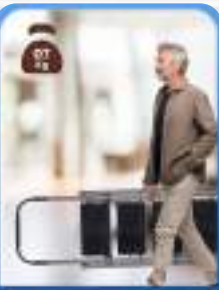
Sturdy and Portable